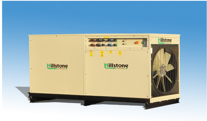
HAC415-500 illustrated with folk lift frame

The Hillstone HAC series load banks offer a low cost solution to on-site AC testing of generators and UPS systems. Units incorporate force cooled high powered resistor elements controlled via our intelligent hand held controller. Safety features including twist lock cable connectors, HRC fuse protection, fan failure shut down and emergency stop push button. Digital meter and PC interface with data logging facilities are also available. Load banks can also be supplied for both three phase and single phase testing.